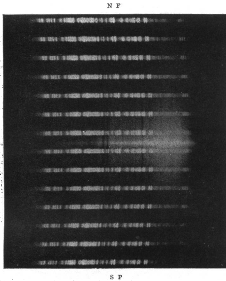
FIG. 1. SPECTRUM OF THE CENTRAL PARTS OF THE ANDROMEDA NEBULA. EXPOSURE 79 HOURS